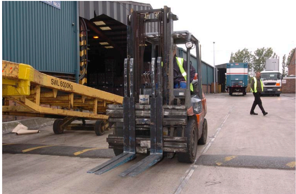
Figure 2 A lift truck passing through an interrupted road hump