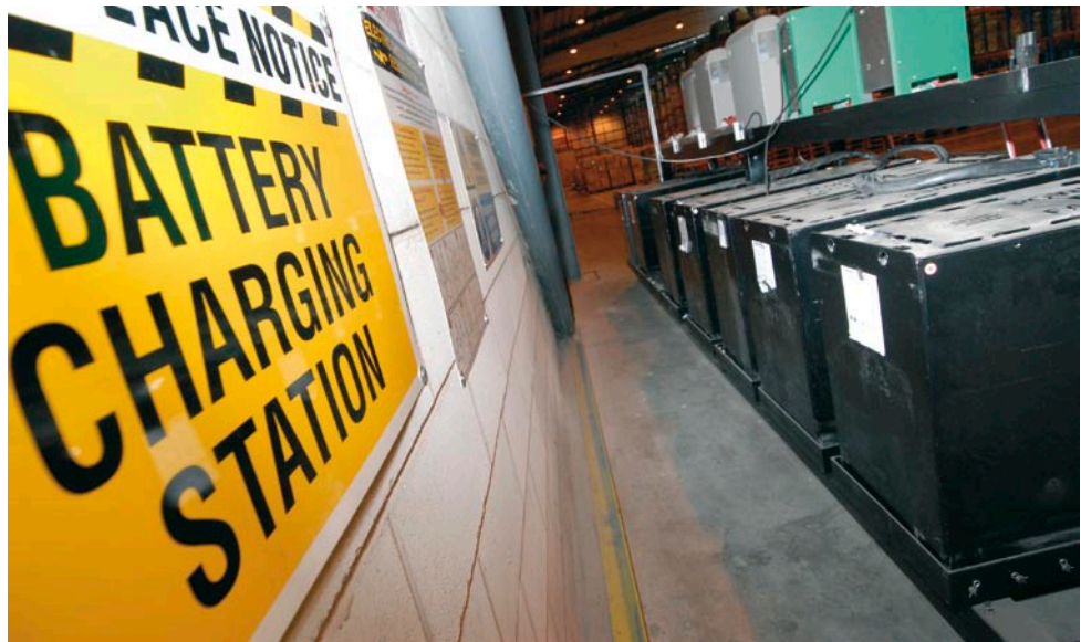
Figure 5 A battery charging station

178 Where batteries have to be changed, for example in a double shift, a safe system of work should be in place. The person responsible for changing the batteries should have suitable training and instruction on how to change them safely. If battery acid may be splashed, wear appropriate protection, for example protective gloves, suitable eye protection and acid-proof clothing.