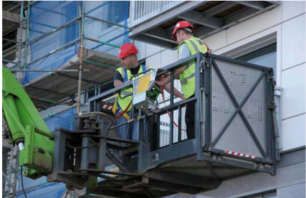
Figure 4 An integrated working platform

151 A non-integrated working platform may only be used in exceptional circumstances for 'occasional unplanned use', for example: