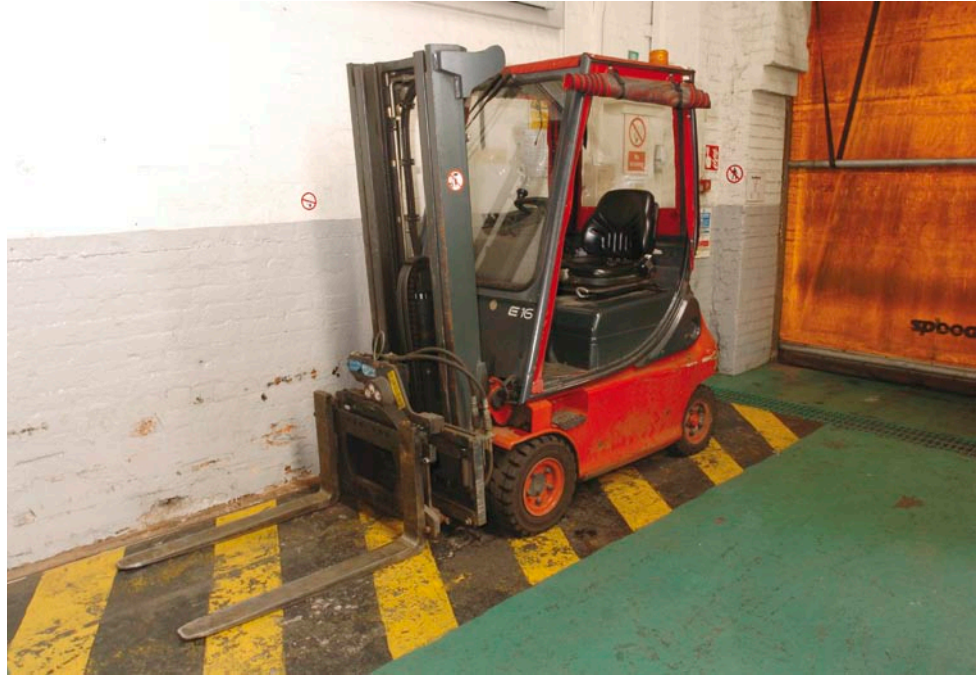
Figure 3 A parking area away from the flow of traffic

137 Provide enough parking areas for all lift trucks. As far as possible, park lift trucks in a secure compound or in a supervised area where they will not be easily accessible to unauthorised people, and preferably separate from main thoroughfares and operating areas. Wherever possible, provide suitable areas for recharging or maintenance.